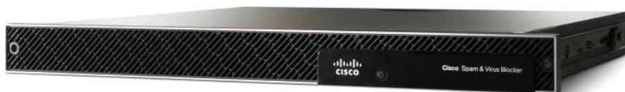
Figure 1. Cisco Spam & Virus Blocker