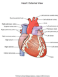
Illustration of an external view of the heart,